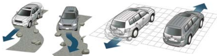
Downhill Assist Control (DAC) keeps a constant low speed to maintain vehicle control on steep terrain.