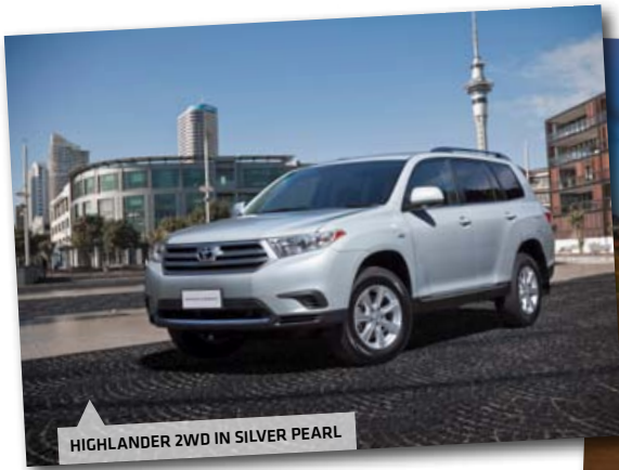
HIGHLANDER 2WD IN SILVER PEARL