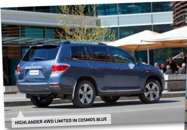
HIGHLANDER 4WD LIMITED IN COSMOS BLUE