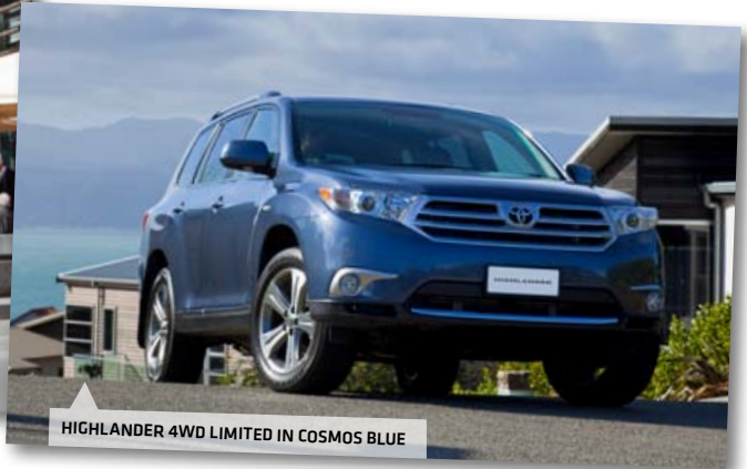
HIGHLANDER 4WD LIMITED IN COSMOS BLUE