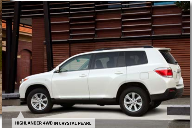
HIGHLANDER 4WD IN CRYSTAL PEARL

A retractable tonneau cover can be used to conceal your belongings and also locks into a half open position. Storage has been created under the floor for the tonneau cover.