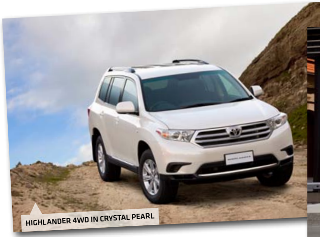
HIGHLANDER 4WD IN CRYSTAL PEARL