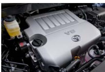
Feel the smooth, quiet ride of the new Highlander powered by a 3.5 litre V6 dual VVT-i engine.

...Highlander has something to offer everyone.