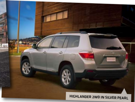
HIGHLANDER 2WD IN SILVER PEARL